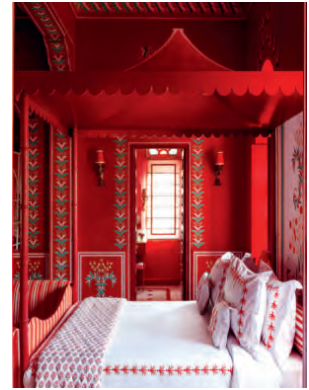
VILLA PALLADIO JAIPUR