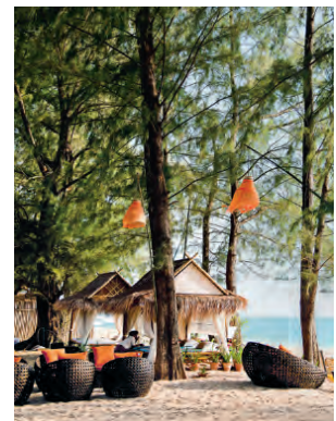
KOH LANTA, THAILAND

FOLLOW US ON INSTAGRAM @CONDENASTTRAVELLER