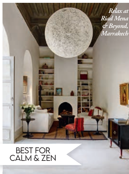
Relax at Riad Mena & Beyond, Marrakech