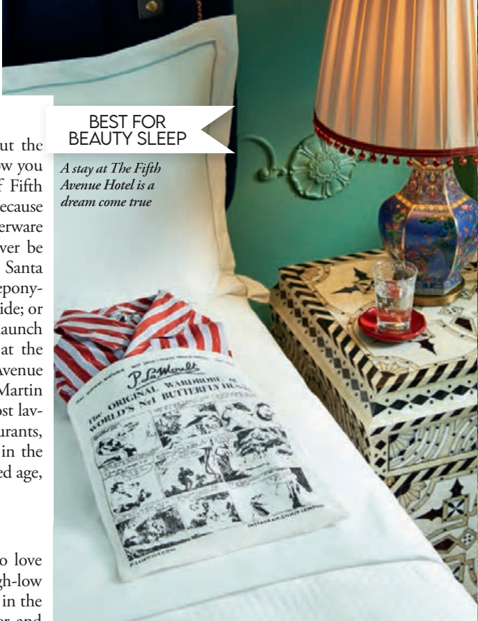
A stay at The Fifth Avenue Hotel is a dream come true