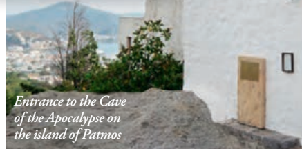
Entrance to the Cave of the Apocalypse on the island of Patmos