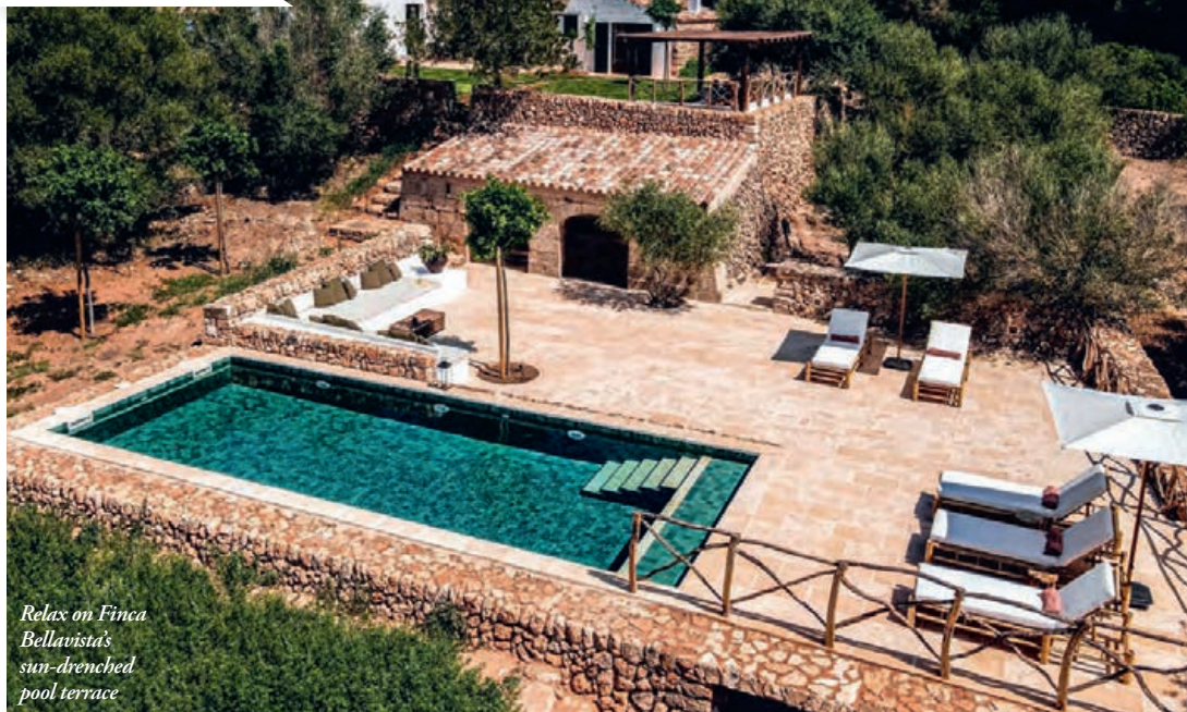
Relax on Finca Bellavista's sun-drenched pool terrace