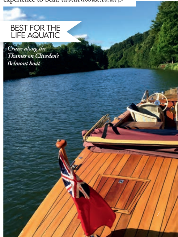
Cruise along the Thames on Cliveden's Belmont boat