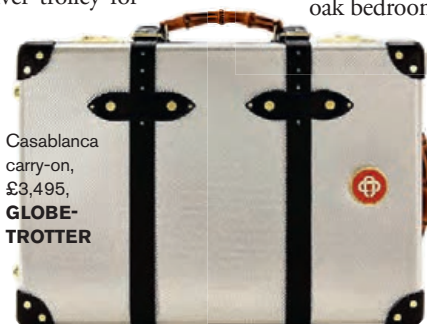
Casablanca carry-on, £3,495, GLOBE- TROTTER

Set to be the best rooftop in Paris when it opens this winter, Hôtel Dame des Arts is where you'll want to be next summer, drinking ice-cold Sancerre and gazing at a heady panorama that encompasses the Eiffel Tower, the Sacré-Coeur and the golden dome of Les Invalides. The mood at this mid-century pleasure-dome in the Latin Quarter embodies boho-Left-Bank glamour but has a totally original take: Raphael Navot's interiors are furiously stylish, especially the mesmerising fluted-oak bedroom walls. damedesarts.com