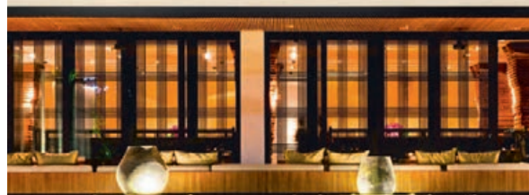
Como Metropolitan Bangkok's Nahm restaurant overlooks the water