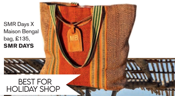
SMR Days X Maison Bengal bag, £135, SMR DAYS

This summer, SMR Days flew out of the shops at Six Senses Ibiza; and it's not hard to see why. The new menswear label excels in oversized cotton shirts, linen trousers and the most divine carry-everything-on-the-plane tote bags – all hand-woven. Its sustainable credentials are sky-high, too: it has partnered with Maison Bengal, a textile company that helps to fight poverty in Bangladesh, supporting women in marginalised communities. smrdays.com