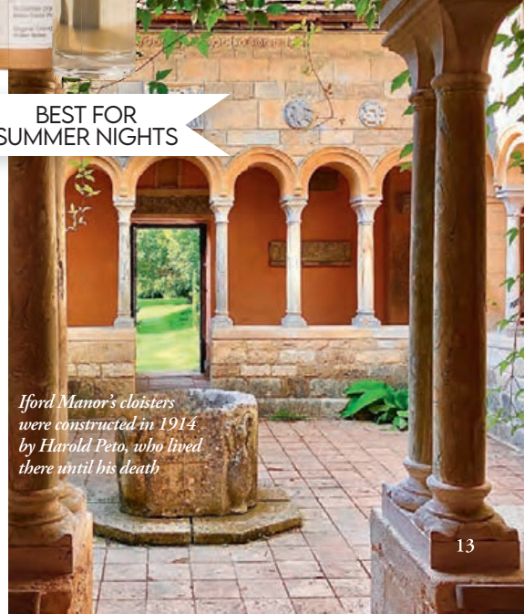
Iford Manor's cloisters were constructed in 1914 by Harold Peto, who lived there until his death